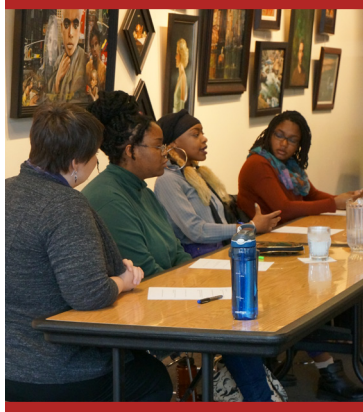
Local community activists spoke at two Forums about the Black Lives Matter movement.

Several groups developed at First Unitarian to address issues of racial justice, to understand white privilege, and implement methods to decrease the school-to-prison pipeline in Iowa.