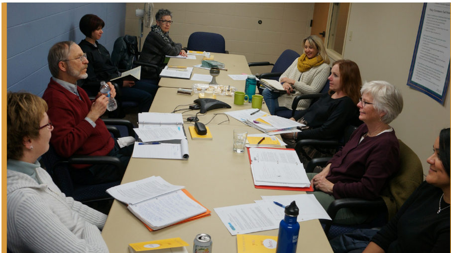
Wellspring participants met twice-a-month to discuss readings and share their journeys.