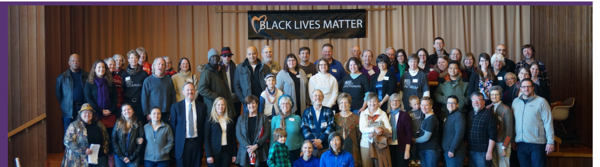
this cause and to work to end the disproportionate incarceration and police shootings of African-Americans.