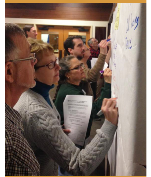
A Social Justice Empowerment Workshop helped attendees understand the social justice history of First Unitarian and envision its future.