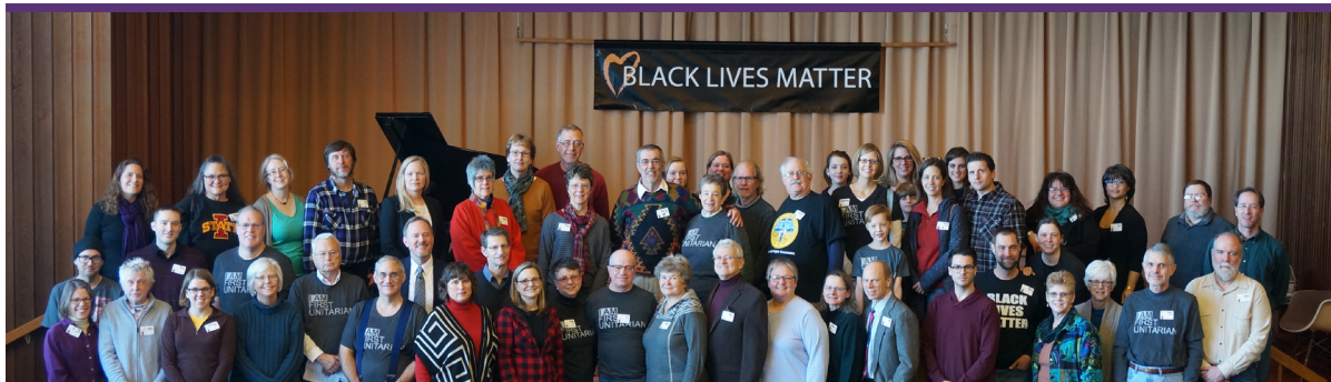
Our church dedicated a Black Lives Matter banner on January 10, 2016. Our principles call us to support