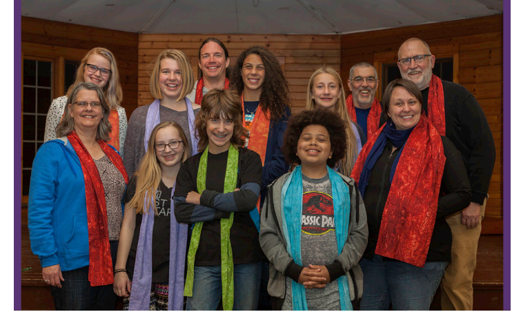
The youth and facilitators of this year’s Coming of Age Program.